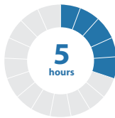
About 5 hours available