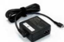
Additional dynabook Universal USB Type C™ PD AC Adaptor (PA5352E-1AC3)