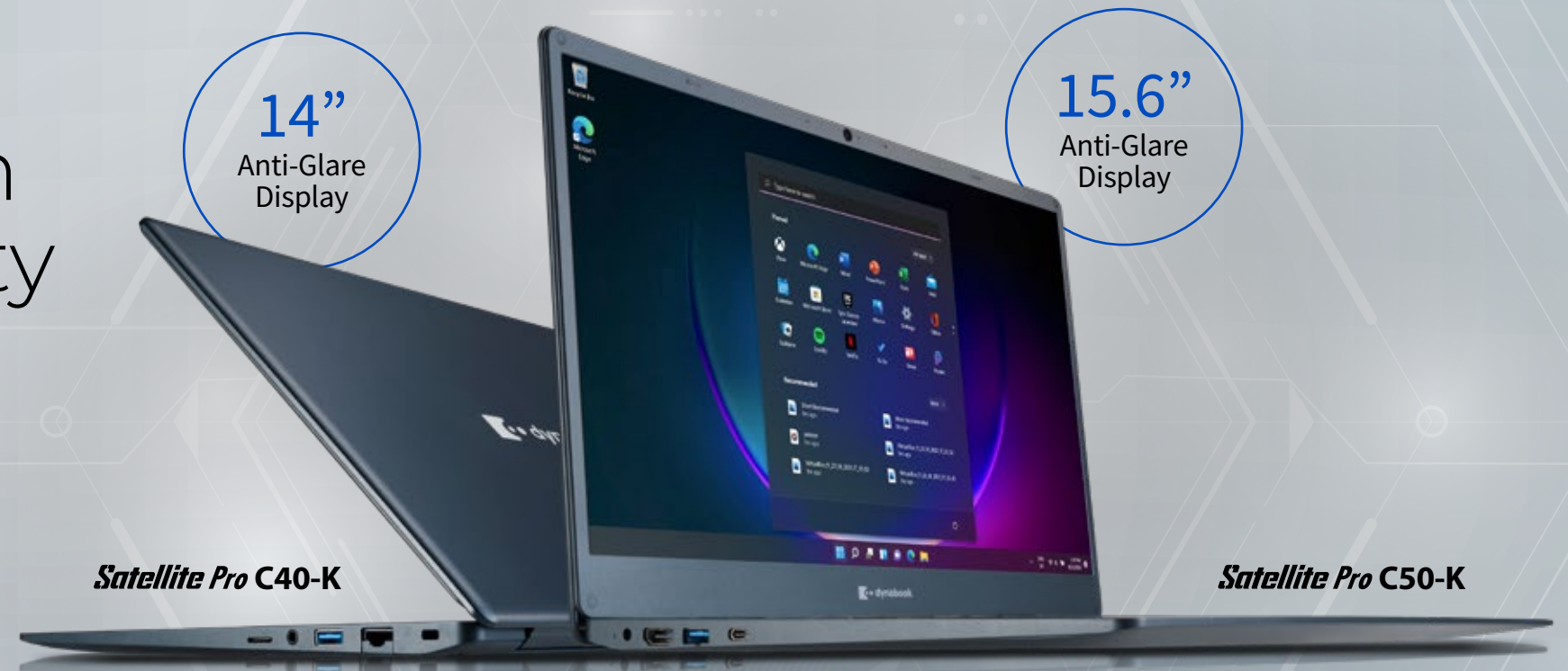
Satellite Pro C40-K

Unlock a new era of seamless work performance with the ultraportable Satellite Pro C40/C50 series, equipped with fully loaded features including the latest USB Type-C™ port to provide a one-click connection to your most-used peripherals, making multitasking easier than before. Coated with a special anti-bacterial dark blue finish to inhibit bacterial growth, this ultra-slim, narrow-bezel laptop is ready to take on any business task you throw its way so you can work in style.