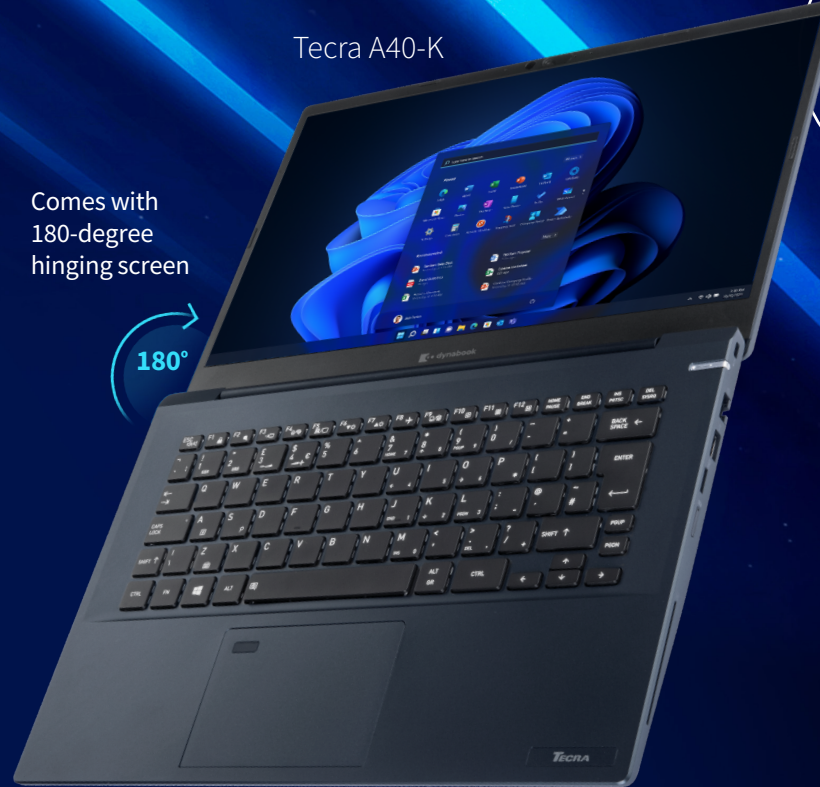
Comes with 180-degree hinging screen

Powerful yet portable Presenting the new standard for hybrid working