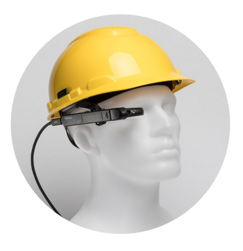
Safety Helmet Clips